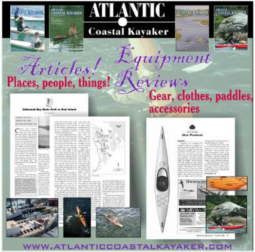
Trade and exhibit displays